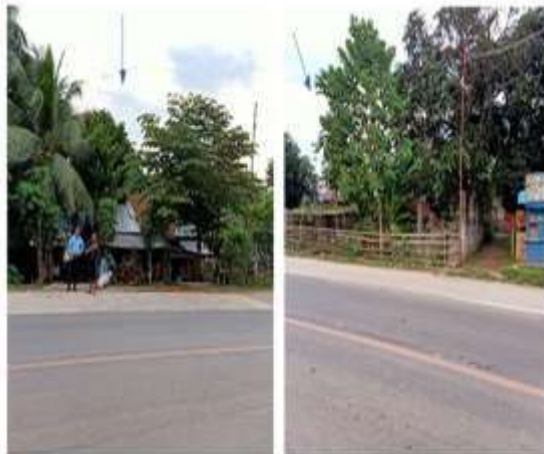
Frontal View of the Property on Provincial Road